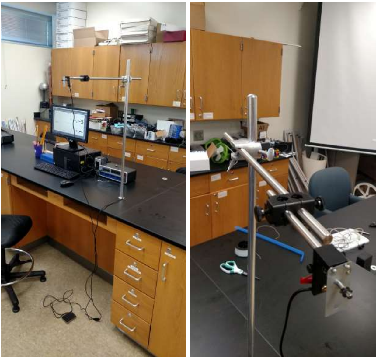
Figure 1: Set up for the Gravity Lab