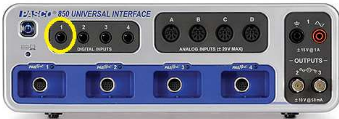
Figure 2: The PASCO 850 Universal Interface. Digital Port 1 is circled.